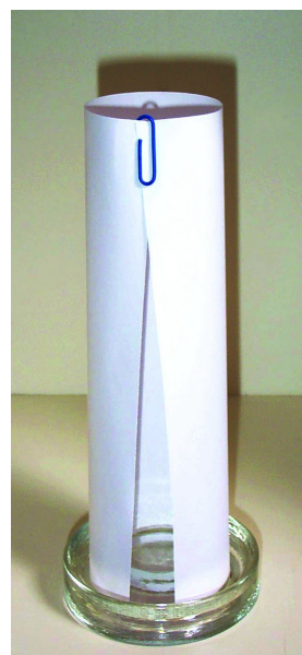
Above: filter paper set up for a rising picture in a specially shaped dish.

Janet Barker refrains from giving any proof of quality, either of the rising picture method or of rhythmical procedure for processing medicinal plants developed by WALA Heilmittel GmbH. But what I find strongly pervades the text is that she primarily wishes to manufacture medicines. Knowledge about the plant, for example its time of harvesting, or about the pharmaceutical process is presented not abstractly but rather as